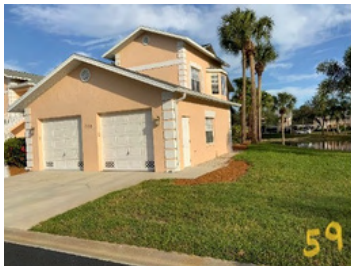
Building # 688