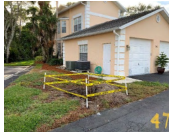
Building # 741