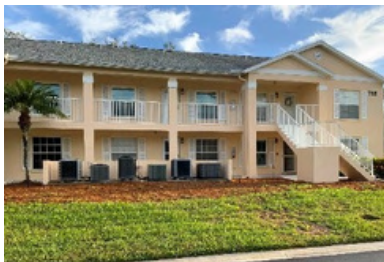
Building # 765