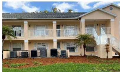
Building # 773