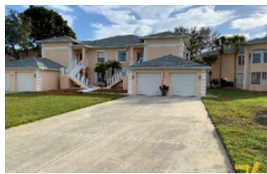
Building # 434