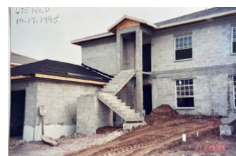
675 Wiggins Lake Drive, 1995