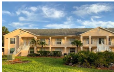
Building # 781