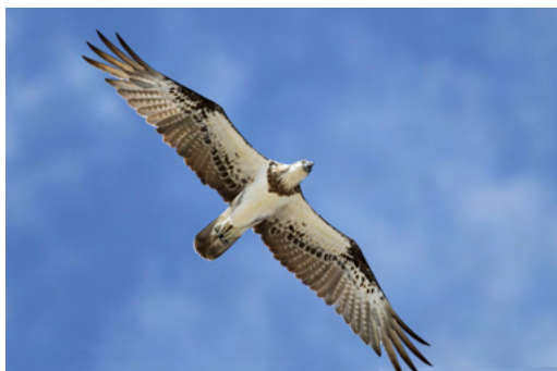
A huge osprey soars over our Preserve